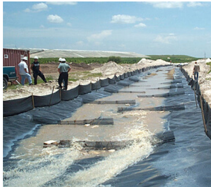
Floc Logs® installed between wattles for increased mixing and reaction.